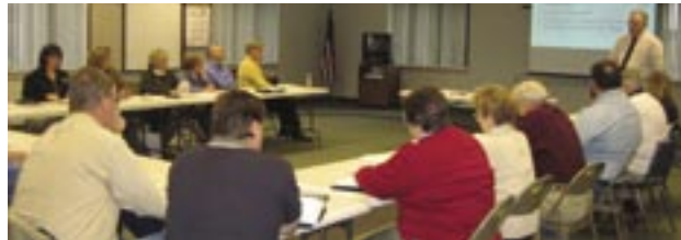
Barron Electric's Board of Directors and staff review recommendations for the 2008 budget.

Over $600,000 will be spent on ROW Clearing.