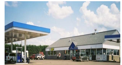
Trego Travel Center

Barron Electric Cooperative Economic Development 1434 State Highway 25 North Barron, WI 54812 715-537-3171 or (800) 322-1008 www.barronelectric.com