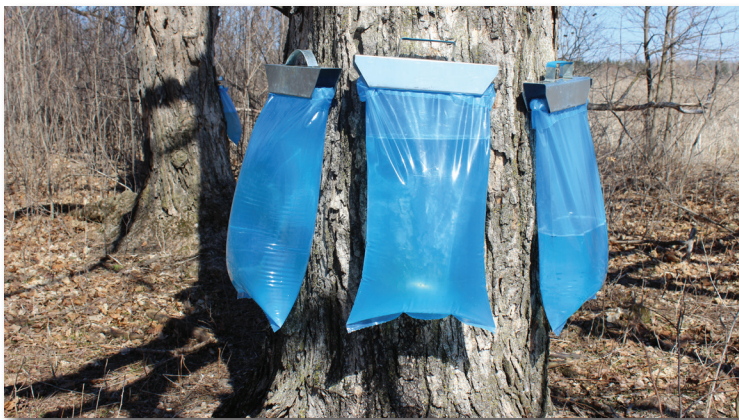
Maple syrup starts by tapping maple trees and collecting the sap.