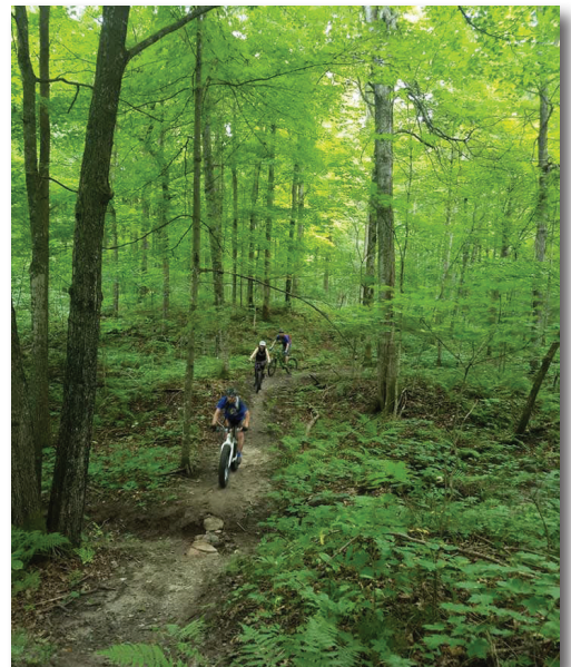
Pictured left: Prickly Ash Oil can help sore joints, muscles, and tendons by stimulating circulation bringing relief to those areas. Pictured right: Check out nearby trails for mountain biking and hiking. Visit silvercreeksprings.com or find them on Facebook.