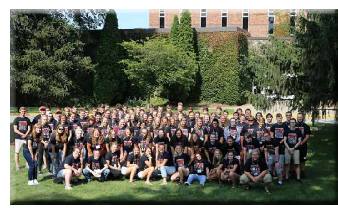
More than 120 students attended last year's Youth Leadership Congress.

o you want to improve your leadership and communication skills, have the opportunity to organize a cooperative, and meet people from across the state? The WECA Youth Leadership Congress will be held July 24-26 at UW-River Falls. Social media coverage can be viewed by searching #wiscylc2016. For application forms, please contact our office at 800-322-1008 or memberservices@barronelectric.com.