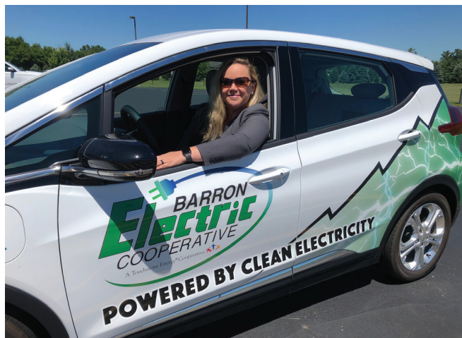
Test out Barron Electric's all electric Chevy Bolt.

Charging the vehicle is as easy as plugging in a cell phone. A color touch-screen display gives you real-time vehicle information, shows your battery levels, estimated range and charge settings.