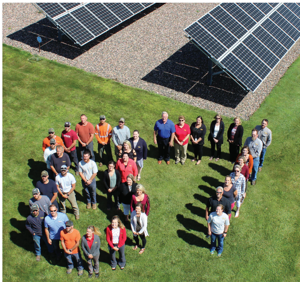
Employees created an 87, the score members gave the cooperative after completing an ACSI survey in 2019.

Barron Electric members gave the cooperative a score of 87 on the ACSI survey conducted in 2019. ACSI is the only uniform, national, cross industry measure of satisfaction. ACSI measures four key areas: overall customer satisfaction, how a utility measures up to expectations, how it compares to an "ideal" utility, and customer loyalty.