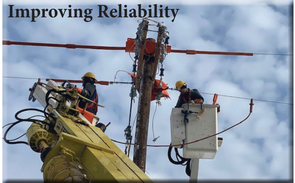
Crews changed a pole and added equipment along a 3-phase line to improve both safety and reliability in the Long Lake area.