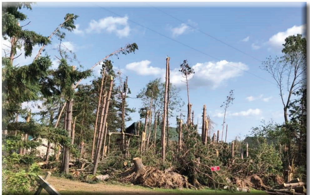
Two derechos and two tornadoes left extensive damage on July 19.

Electric cooperatives that experienced significant expenses related to destructive weather from July 18-20 may be able to recover as much as 87% of these costs under a federal disaster declaration. Barron Electric Cooperative had over $1.5 million in damages. The federal government will cover 75% of the cost of eligible recovery activities. The remaining 25% is to be covered at the state level, with 12.5% paid by Wisconsin Emergency Management and the cooperative responsible for the remaining 12.5%.