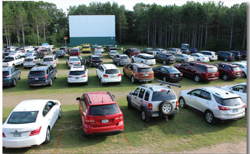
The Stardust Drive-in Movie Theater was home to over 600 members and guests as they tuned into Barron Electric's annual meeting.