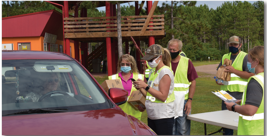
Employees wore face masks and sanitized to keep everyone safe as they registered members.

the grand prize winner of a free year of energy, excluding fixed charges. The Turtle Lake Food Pantry collected nearly 300 food items, and they greatly appreciated the support.