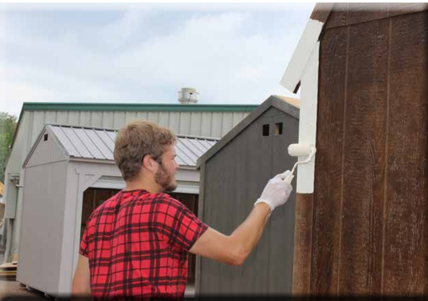
Trim is added to this customized shed.