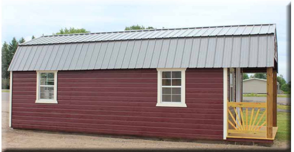
A side porch package can be added to a utility shed or lofted barn.

Mix above. Then add 2/3 cup raisins and 1 chopped apple. Put in muffin tins. Bake at 350 degrees for 22 minutes. Recipe can be doubled. They freeze very well.