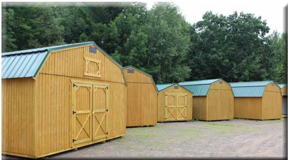
Lofted barns are available in a variety of sizes.