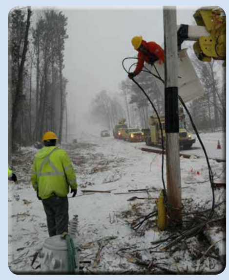
Linecrews were busy in March after storms caused downed trees and power lines.