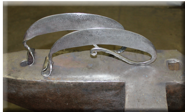
Unique pizza cutters complete a custom order.