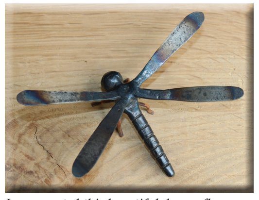
Joyce created this beautiful dragonfly displaying a variety of colors.