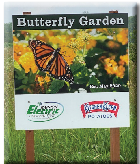
Butterfly gardens were created to attract the Monarch butterfly, which is on the endangered list.