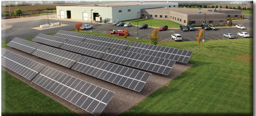
Community Rays was installed in 2014 at Barron Electric's headquarters and provides an affordable option for those members interested in purchasing renewable solar energy.

Barron Electric has installed electric vehicle charging stations in our service territory at the Prime Bar & Family Dining in Trego and at Barron Electric's offices in Spooner and Barron to give those