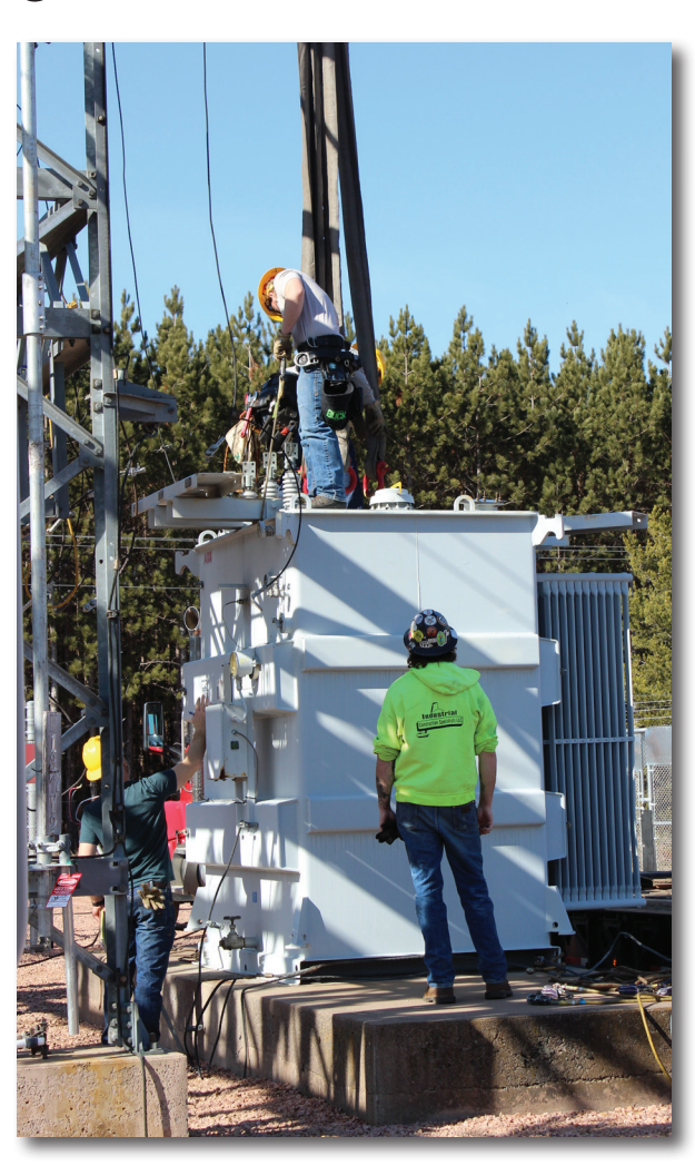
Crews prepared the transformer for energization.

Barron Electric Cooperative works hard to provide reliable power to our members. Barron Electric line crews recently worked with A1 Express, Qualus, Dairyland Power Cooperative, and Dawes Crane to change out the substation transformer at the Springbrook Substation to allow more capacity to supply electricity to the members in this area.