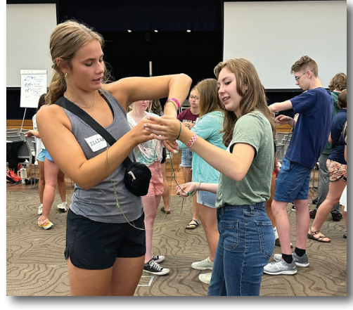
Students have fun with teambuilding activities.

Please contact Barron Electric at 800-322-1008 or e-mail memberservices@barronelectric.com for more details. The deadline for applying is June 7, 2024.