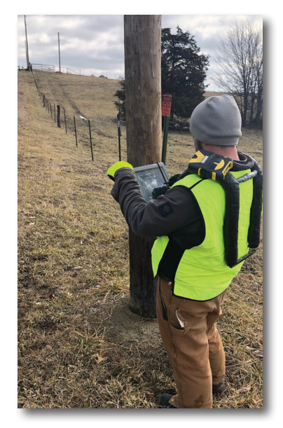
This spring, Global Mapping Solutions will begin inventory of the cooperative's system.

If you have questions or concerns, please contact the Operations Department at 800-322-1008 or operations@barronelectric.com.