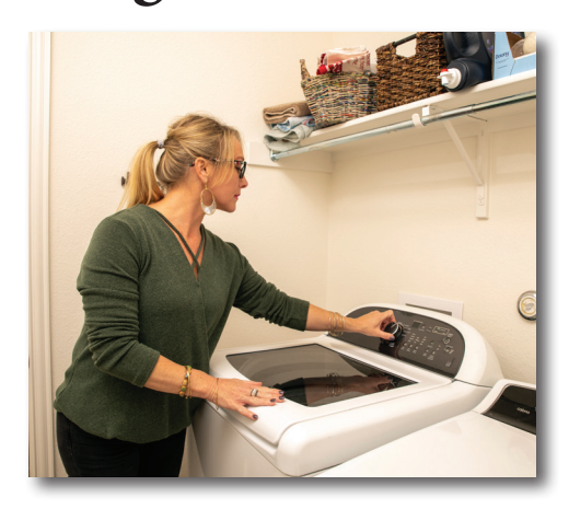
Visit our website at barronelectric.com for more details on Energy Star® rebates. Rebates must be submitted within three months of purchase.

When purchasing new appliances, look for the Energy Star label, which ensures you are buying one of the top efficient models. Barron Electric offers rebates on the following appliances: