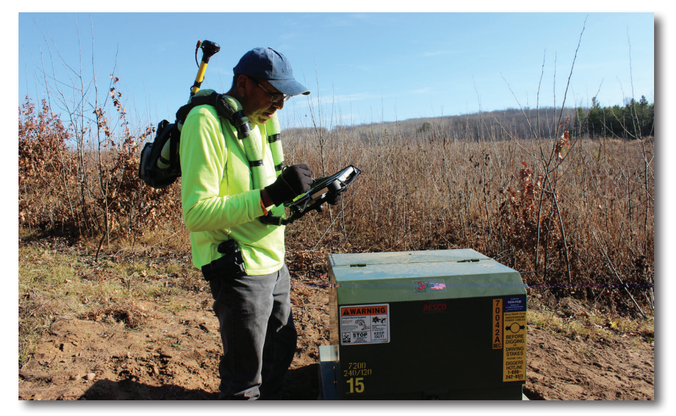
GMS crews may be on your property this summer as they take inventory of Barron Electric's equipment.

Global Mapping Solutions(GMS), contracted by Barron Electric, will continue gathering data on our system, which may include working weekends and any daylight hours. They may be on your property by foot, ATV, or UTV, taking photos of Barron Electric equipment, posting signs, or locating cable.