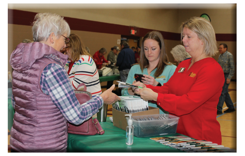
More than 300 members and guests attended Barron Electric's 88th annual meeting.

of grocery items and cash to the Prairie Farm Food Pantry to help support those in need. The Barron VFW prepared and served breakfast to over 300 members and guests. Twelve Barron Electric members won a $100 cash prize. All attendees received a pound of cheese.