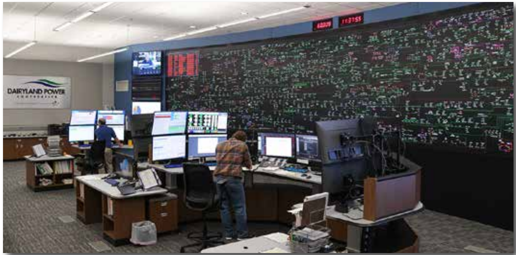
Dairyland Power's System Operations Center allows operators to monitor the system in real-time, which is critical as system conditions are rapidly changing.

wind and additional hydro, solar and biomass generation from facilities in Iowa, Illinois, Minnesota, South Dakota and Wisconsin. Dairyland has power purchase agreements for more than 200 MW of wind generation, while they have 45 megawatts of solar generation capacity. In September, Dairyland submitted a Letter of Interest for funding through the USDA's New Empowering Rural America (New ERA) grants program. Dairyland's proposed