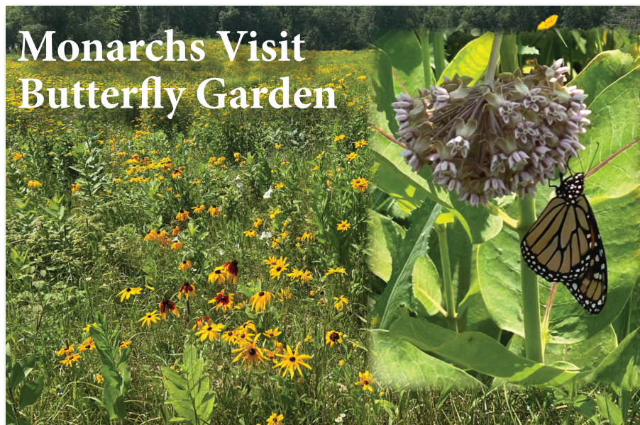
Member Nuto Farms teamed up with Barron Electric to develop this butterfly field in Sarona. This is one of three gardens created by Barron Electric to help attract Monarch butterflies. Monarchs are decreasing in population as a result of habitat loss, pesticides and climate change.