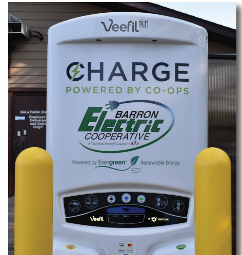
Barron Electric installed a fast charger at the Prime Bar & Family Dining in Trego. This can charge 60-100 miles of range per hour. Charge™, a group of cooperatives, connects EV owners to a network of electric vehicle charging.

Barron Electric offers a free Level 2 electric vehicle charger to members who purchase an electric vehicle. The charger works with all EVs, including Tesla vehicles, using Tesla's charging adapter. The cooperative requires charging at night when demand for electricity is low. Visit barronelectric.com and click on the rebate tab for more details.