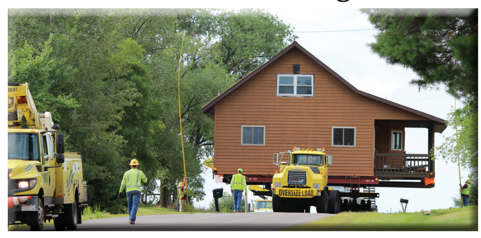
Barron Electric line crews were on hand to assist with a house move that traveled eight miles through rural Chetek. Wires were lifted or dropped at 20 different crossings as the 27' house made its way to a new home. We appreciate members' patience during this process.