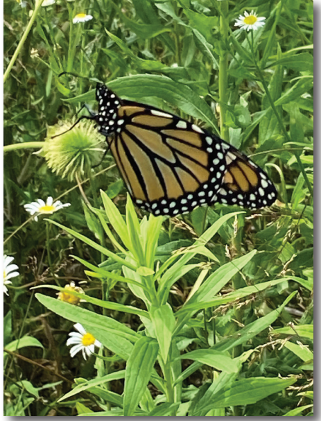
The Butterfly Garden in Sarona was a team effort between Member Nuto Farms and Barron Electric Cooperative. Monarch butterflies have been listed as an endangered species by the International Union for Conservation of Nature, due to a significant decline since the 1980s. Barron Electric has created three gardens to help attract Monarch butterflies.