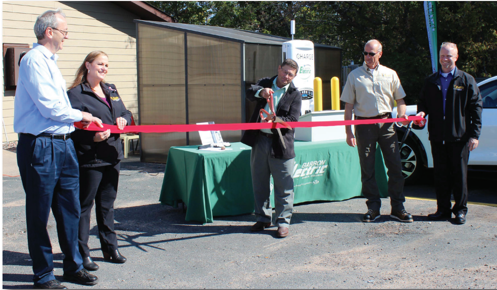
Barron Electric held a grand opening at The Prime Family Dining in Trego, where a Level 3 DC fast electric vehicle charger was installed as well as a Level 2 charger. This helped fill a 155-mile gap between fast chargers on Highway 53.

directors for an exciting beginning. I look forward to continuing to serve the membership and safely providing energy, products, and services to improve the quality of life in the area we serve; just like our mission statement says.