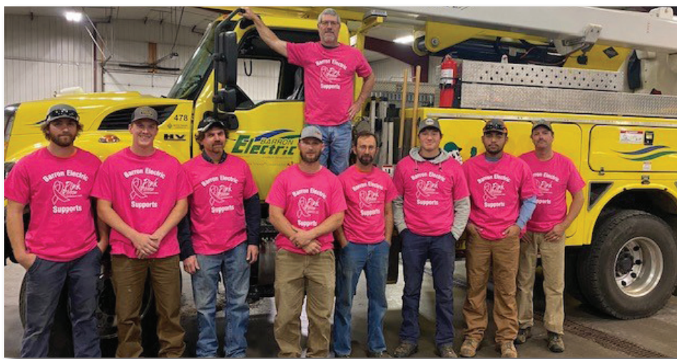
Employees show their concern for community by supporting Pink Ribbon Advocacy.