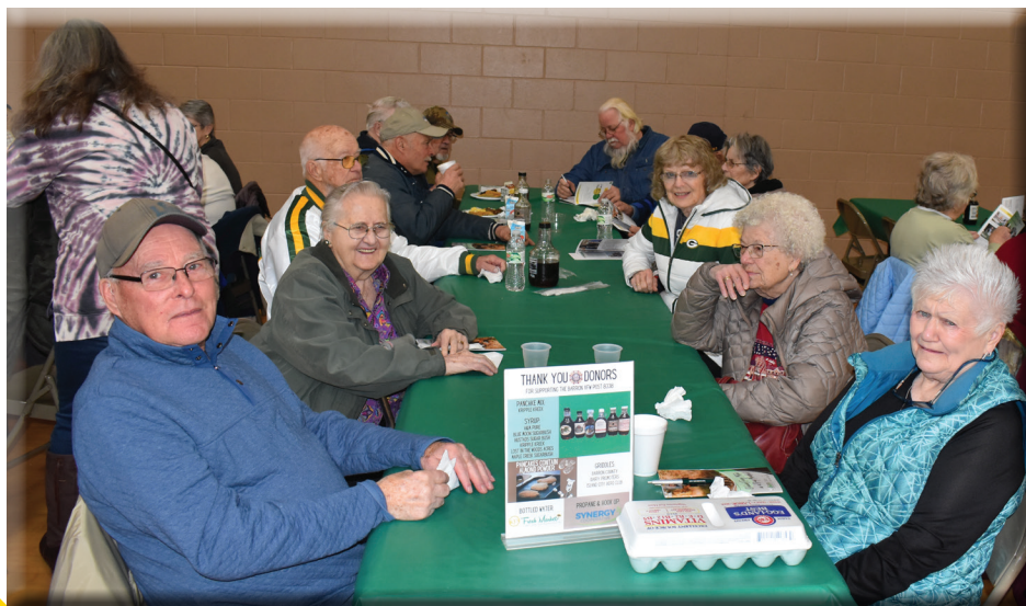
Members and guests enjoyed breakfast prepared and served by the Barron VFW.