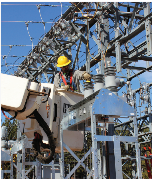
A larger transformer was installed at the Springbrook Substation to increase capacity.

system. They provide a report of those poles that need to be replaced.