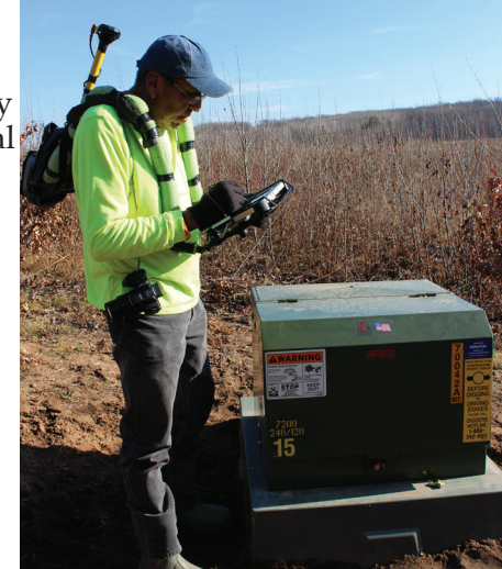
Global Mapping Solutions collects data on the cooperative's system.

In 2024, Barron Electric Cooperative hired Global Mapping Solutions (GMS) to collect data on the cooperative's system which includes GPS coordinates of all equipment. Once this project is completed in 2026, this will help improve the outage dispatch process, increase map accuracy, improve outage communication accuracy to members, and provide a safer electric system for Barron Electric crews, contractors, members, and the public.